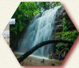
BHEEMUNI PAADAM WATERFALLS