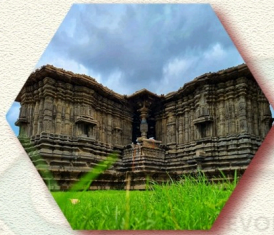
THOUSAND PILLAR TEMPLE